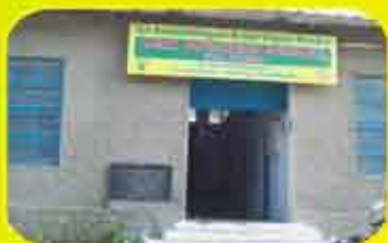
Agri Business School