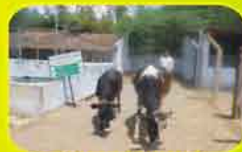
Calf rearing unit