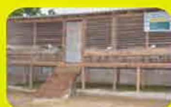
Stall fed Goatery