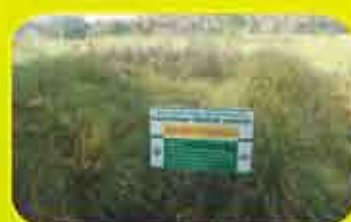
Soil binding grasses