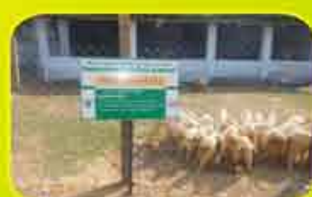
Goat rearing unit