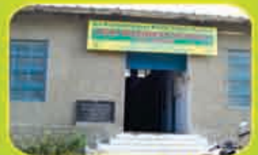
Agri Business School