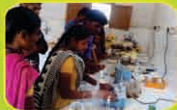
Soil water testing lab