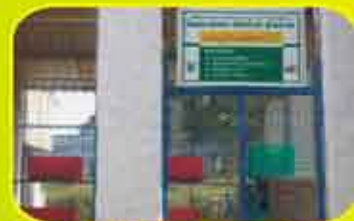
Earth Worm rearing